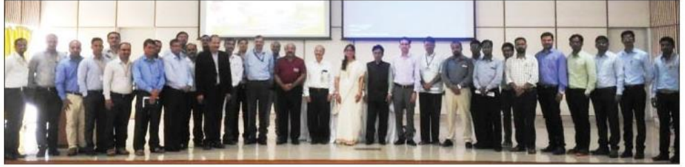
सेमिनारमधील तज्ज्ञ मार्गदर्शकांसोबत उपस्थित पदवी व पदविका महाविद्यालयातील प्राचार्य, विभागप्रमुख व प्राध्यापक वर्ग.

या सेमिनारमध्ये महाविद्यालयातील तृतीय व चतुर्थ वर्ष इलेक्ट्रिकल व मेकॅनिकल अभियांत्रिकीच्या विद्यार्थ्यांना इंडस्ट्रीजमध्ये इंजिनियर म्हणून उज्वल करीअर घडवण्यासाठी पुस्तकी ज्ञानासोबतच प्रात्यक्षिक ज्ञानही कसे महत्वाचे आहे यासंदर्भात मार्गदर्शन करण्यात आले. विविध प्रकारच्या कंपन्या आणि विशेषतः वीजनिर्मिती प्रकल्पात काम करणाऱ्या अभियंत्यास एक विद्युत (इलेक्ट्रिकल) अथवा यंत्र