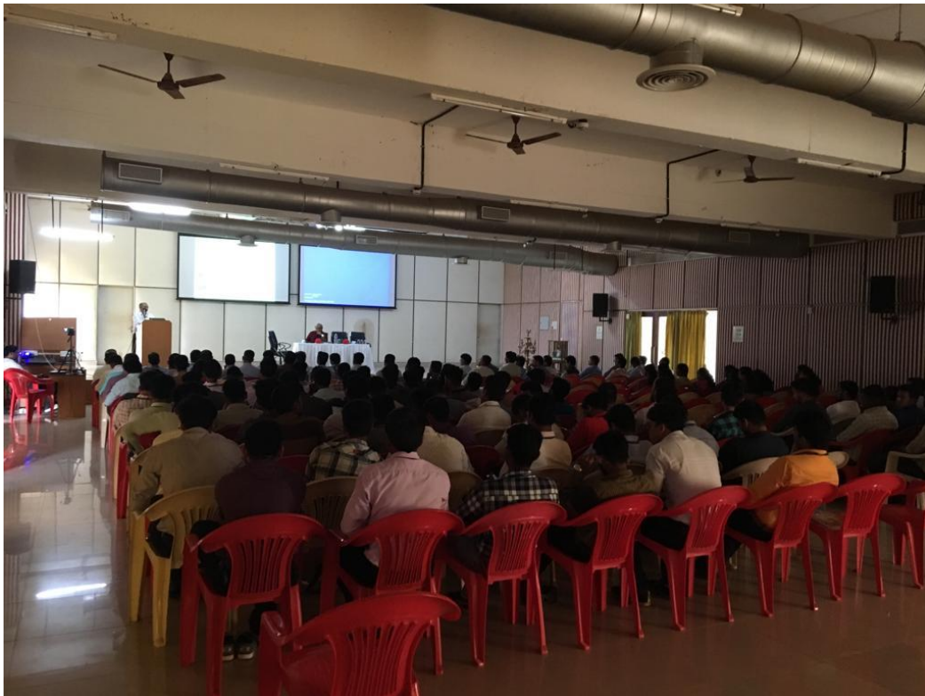
Photographs during actual session.